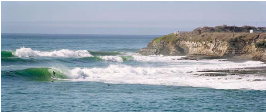
One of Santa Cruz's many cold-water dream waves. Natural Bridges.