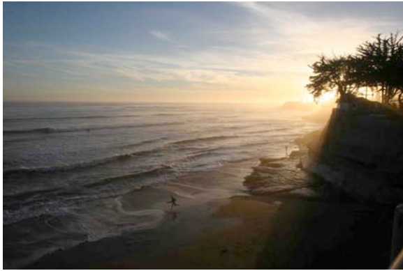
The coastline along Santa Cruz's iconic Pleasure Point.

PRESS RELEASE #2 - December 12 th , 2011